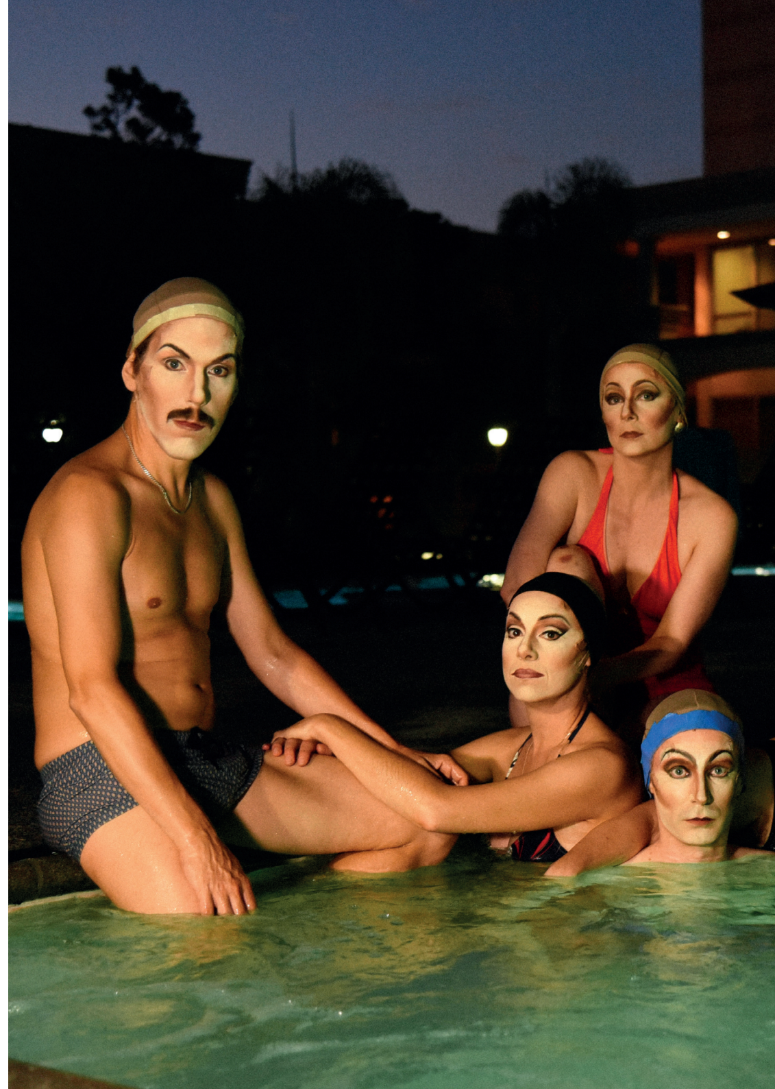
*Booking fees apply at liftfestival.com, see page 36