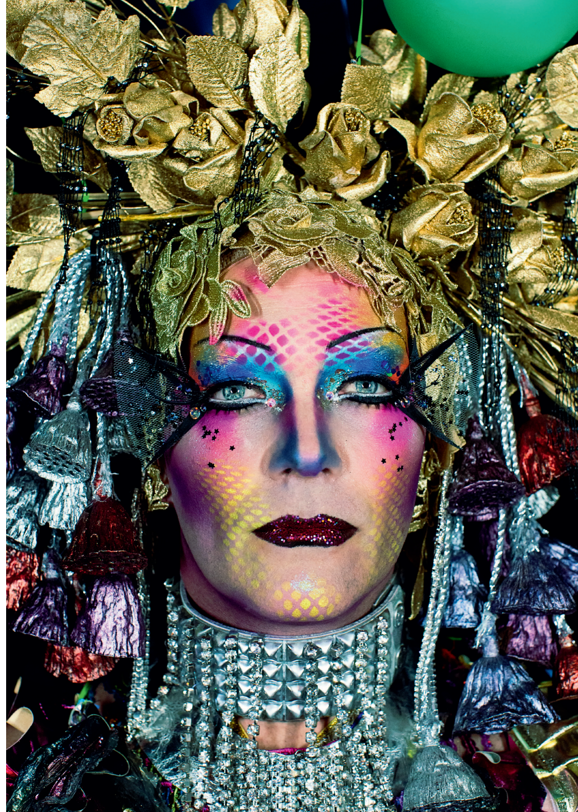
© Little Fang. *Booking fees apply at liftfestival.com, see page 36